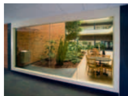
Sensata Technologies Building, Providence